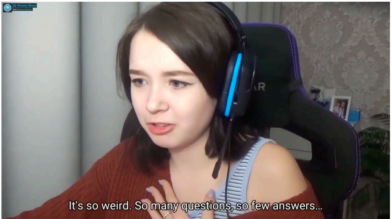
VICTORY SHOW by VIKTORIA (06:24)